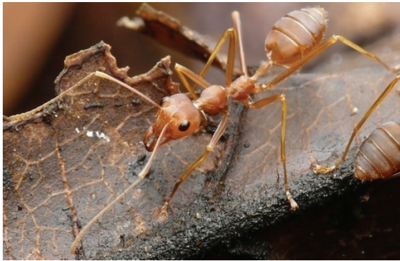
c. Oecophylla smaragdina