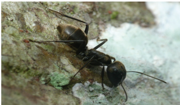
e. Camponotus sp. 3