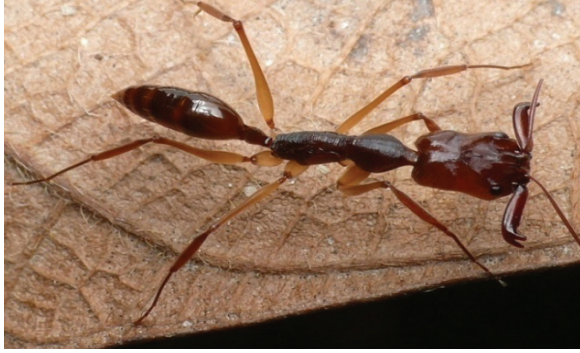
a. Odontomachus simillimus