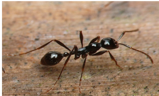
g. Aenictus sp.