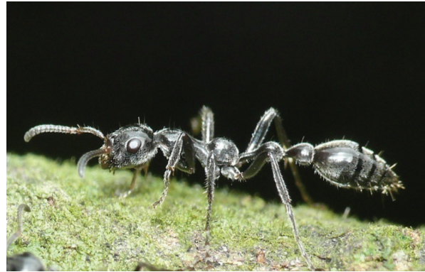
d. Tetraponera sp.