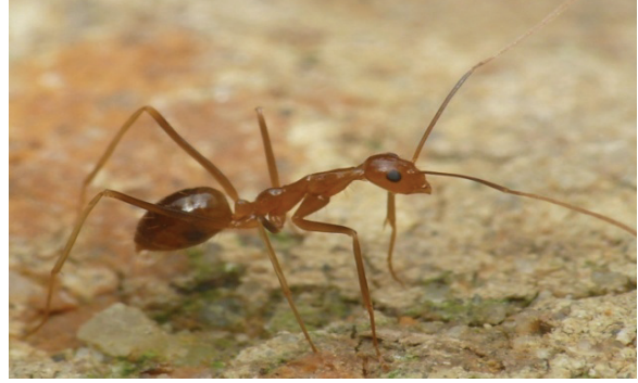
b. Anoplolepis gracilipes