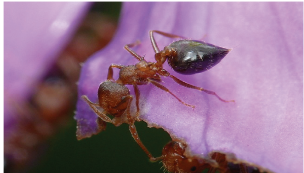
f. Crematogaster sp.