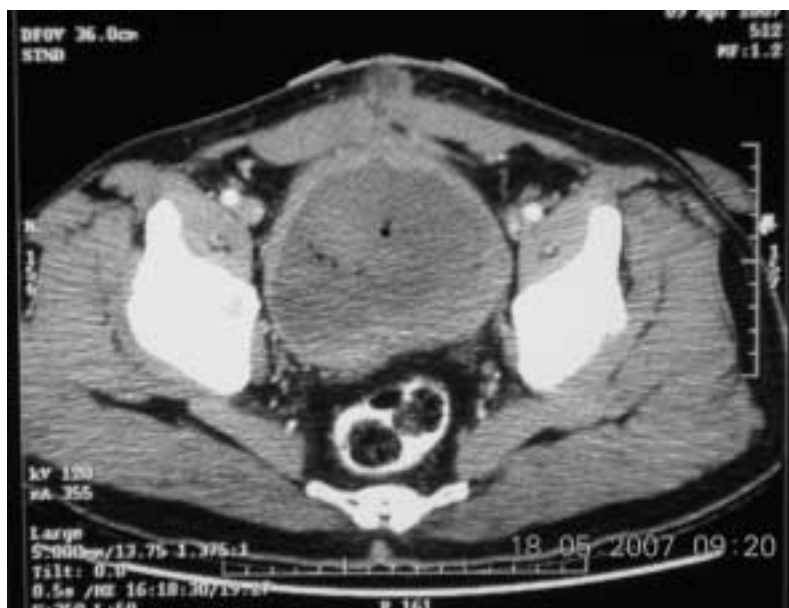
Figure 2. Staging CT scan demonstrated an organ confined lesion, with no lymphadenopathy. The bladder was completely filled with the lesion, interfaced with air filled cavities.